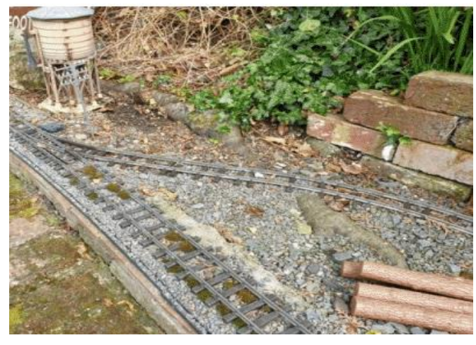
Nothing for it other than to remove the offending roots and rebuild the line. Garden railways really are just like the real thing!