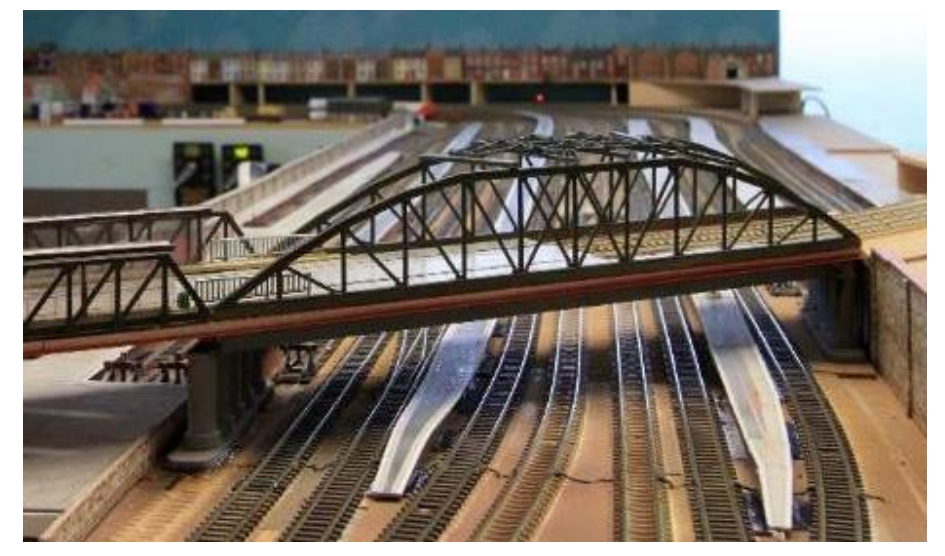
The 7 platforms with 12 platform faces

In the first instance I had designed the layout more for operational interest than for scenic impact, and in so doing I had reduced the platform widths such that the tracks only left a 15ft space and even, in some instances, the BR minimum of 12ft. Not very prototypical for through platforms and made worse because my initial track spacing was done using Mk3 coaches, whereas when I checked against a 9F with its outside cylinders it meant reducing the width still further to a scale 11ft. Still, the die was cast and hopefully nobody will notice if I keep quiet.