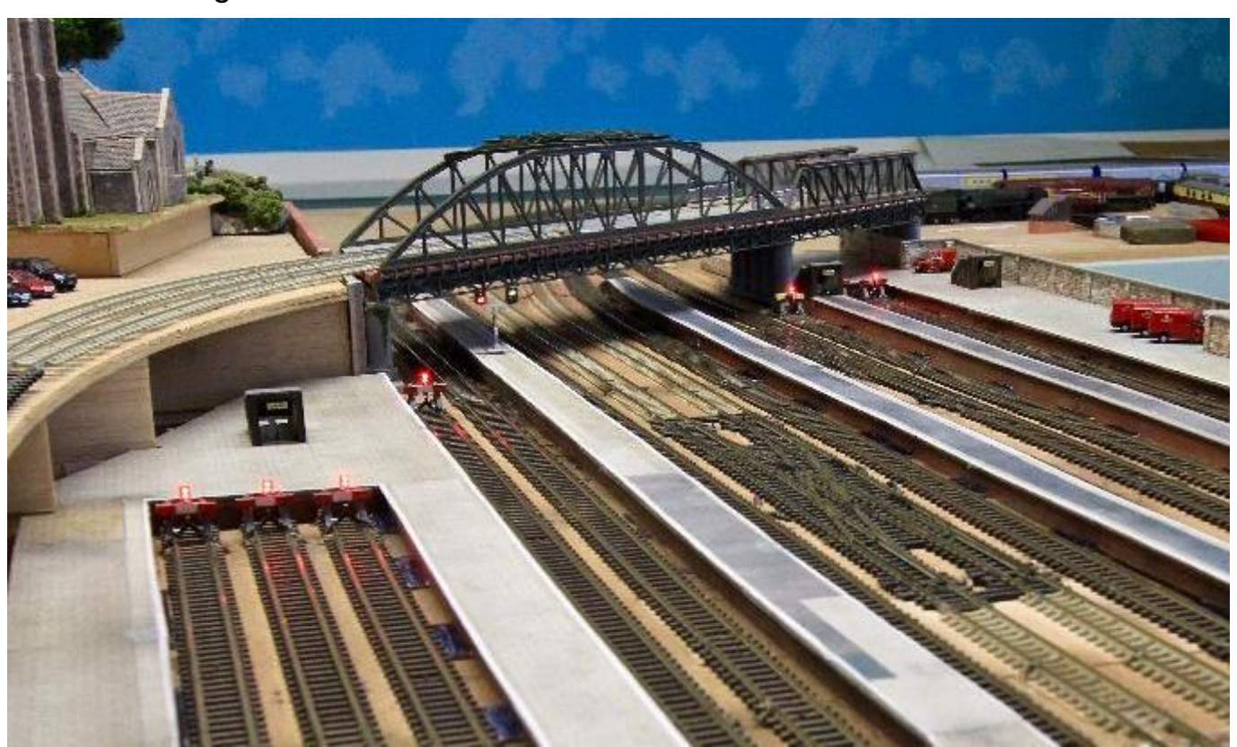
Platforms complete and awaiting the trains