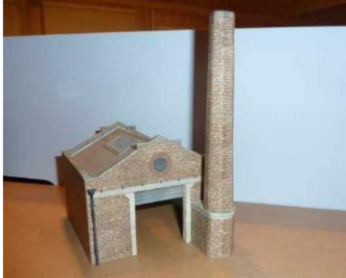
Finally a picture of the two together in their approximate place on the layout. There is a lot of groundwork to be done yet, but I think they make a nice coherent little business group.