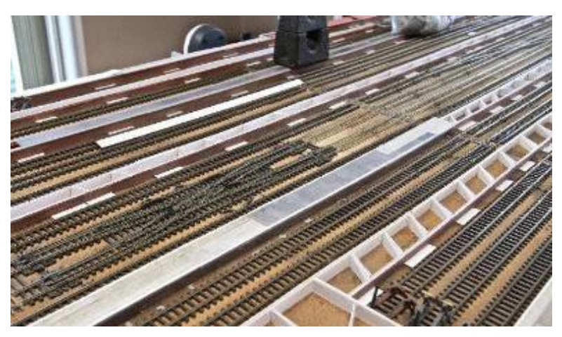
Platforms under construction - showing the clearance spacers

These platforms turned out to be another marathon with the long through platforms able 8+2 HST. accommodate an There are 7 platforms with 12 faces, which proved not only time somewhat consuming but repetitive. I would like to say that it all went smoothly but such was not the case.