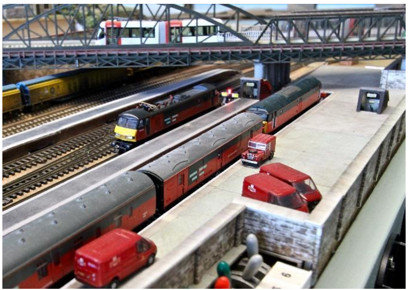
The Royal Mail loading bays